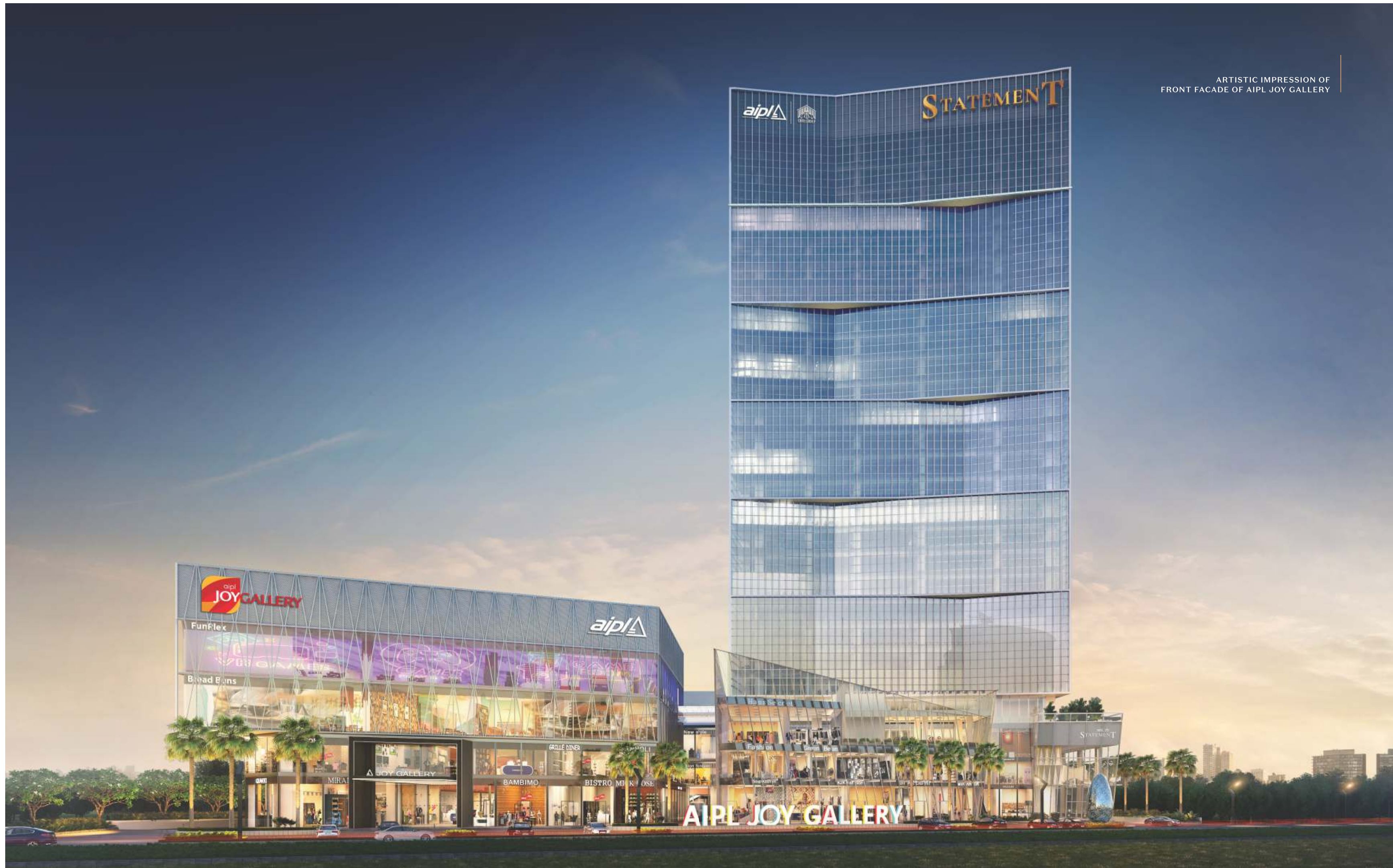
ARTISTIC IMPRESSION OF FRONT FACADE OF AIPL JOY GALLERY

Call 3 Horizons Team For Best Deals : +91 70560-12345