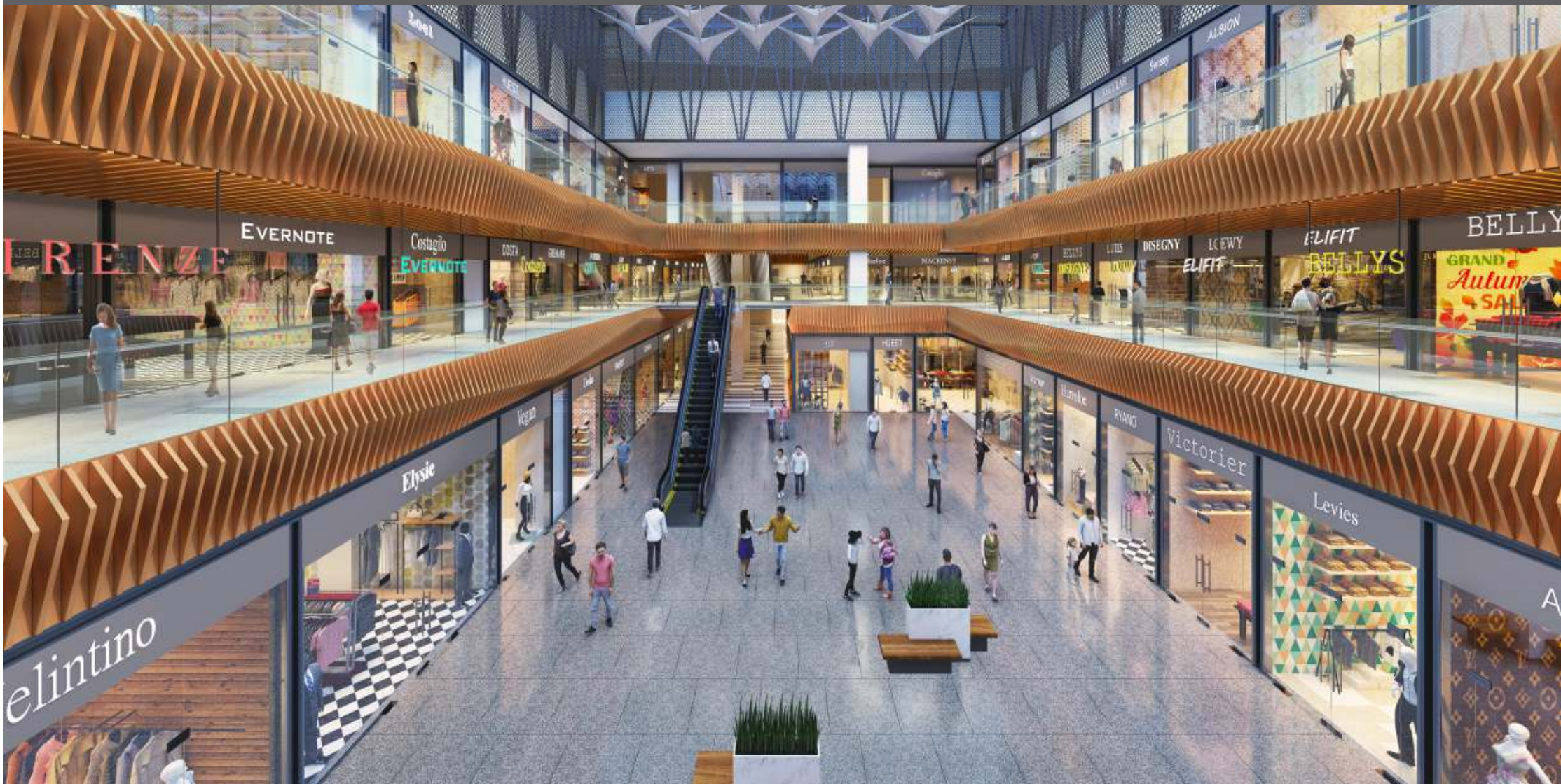
ARTISTIC IMPRESSION OF SHOPPING AREA

AIPL Joy Gallery is a perfect show window for every retail brand. A lavish world covering more than approx 3,44,018 sq. ft. (31960.05 sq. mtr.) of shopping, dining, art and entertainment awaits you. Get lured by the range of prestigious brands and ignite your senses with spread of culinary quest, ranging from casual fare to the delicacies of fine dining.