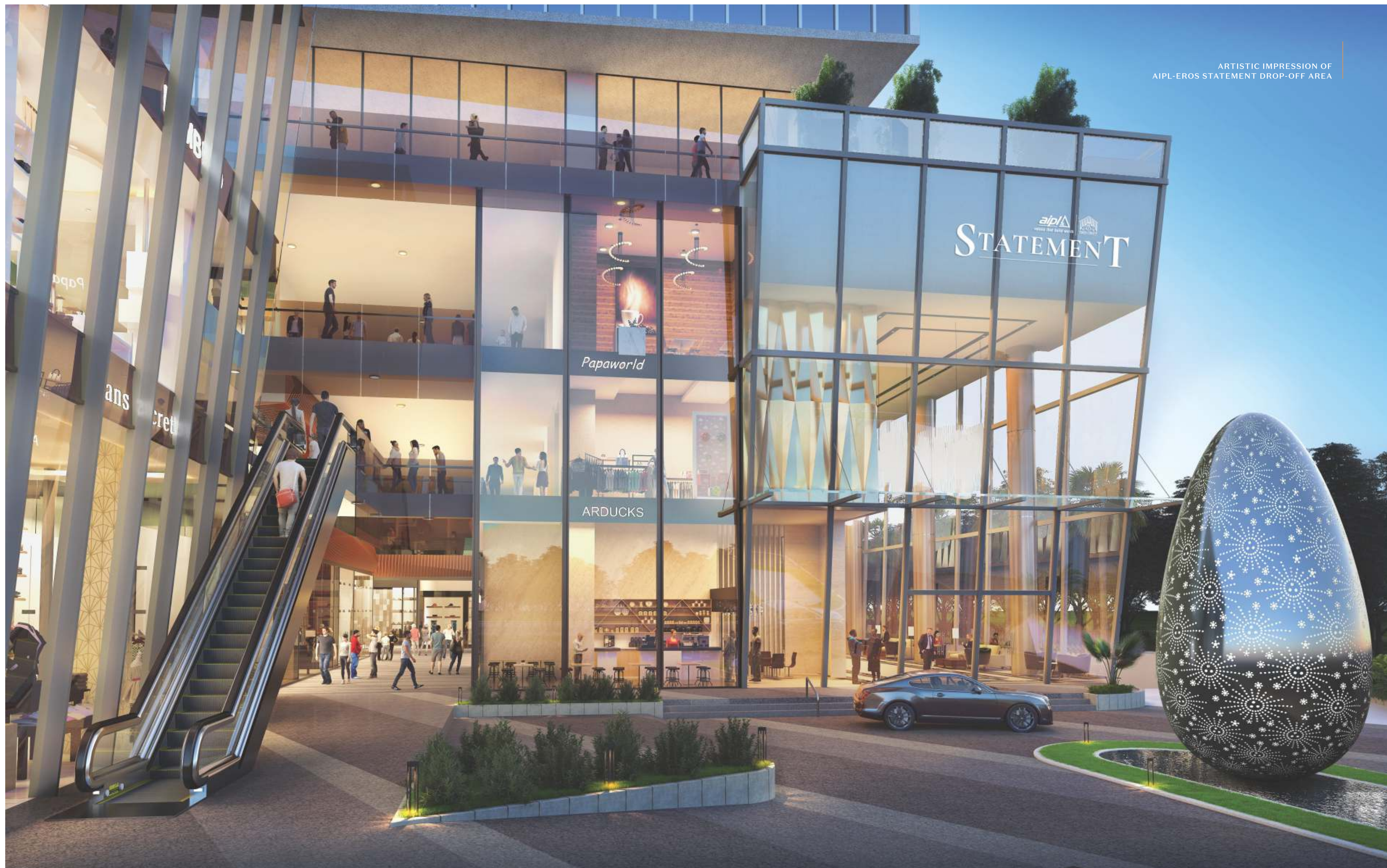
ARTISTIC IMPRESSION OF AIPL-EROS STATEMENT DROP-OFF AREA

Call 3 Horizons Team For Best Deals : +91 70560-12345