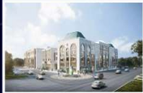
SCO: (SHOP CUM OFFICE) 5.5 CR.* ONWARDS