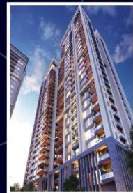
SILVERGLADES HIGHTOWN 3/4 BHK 3.75 CR.* ONWARDS