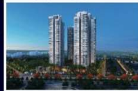
ELEVATE BY CONSCIENT AND HINES SECTOR - 59 3.17 CR.* ONWARDS