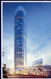
OFFICE SPACE 2 CR.* ONWARDS

THE MOST TRUSTED PARTNER OF THE MOST RELIABLE REAL ESTATE BRANDS