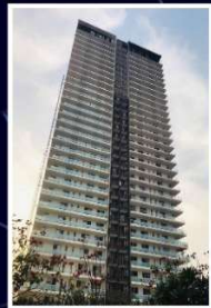
MAHINDRA LUMINARE 3 BHK SECTOR 59