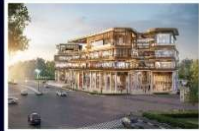
TRIPLE HEIGHT SHOP'S 5 CR.* ONWARDS